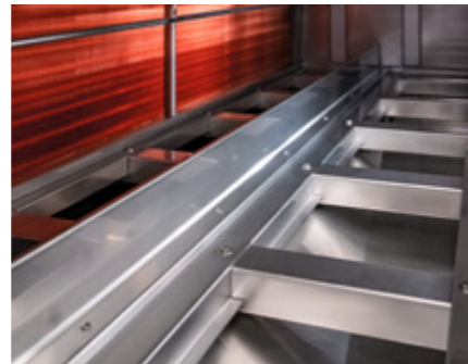
Copper register and trough with breakwater

The fan motors are of course vibration isolated. WEGER has perfectly adapted to the needs of movements at sea: whether with "breakwaters" in condensate trays or special cables and their protection.