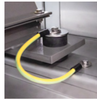
Elastomer dampers for high radial and axial forces