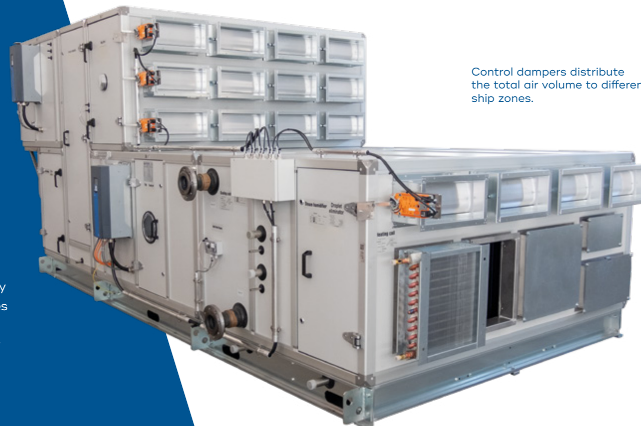
Control dampers distribute the total air volume to different ship zones.

After fulfilling all relevant standards, our systems are delivered as standard on a 120 mm galvanised base frame. In addition to lifting lugs at the load points, openings can also be provided on request for forklift handling. Furthermore, these are also practical „cleaning openings“, regardless of whether the base frame is welded to the ship’s bottom or not.