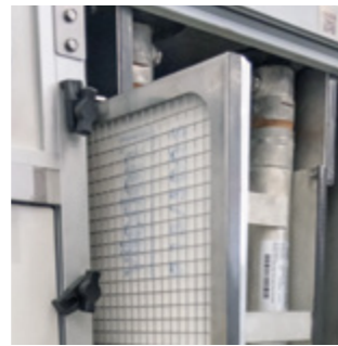
Panel filter with plug-in frame for changing the filter mats